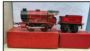
M1 clockwork 0-4-0 Tender Locomotive, bpxd