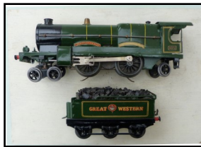
E36 6v. electric 4-4-2 Tender Locomotive