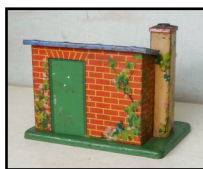
Platelayer's Hut. Non-hinged door