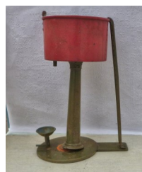
Pre-war No. 2 Water Tank, Complete with ladder and hose