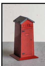
Railway Accessory: 'Platform Fire Hut'