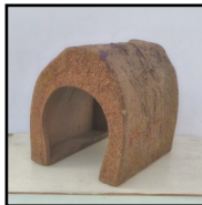
Pre-war No. 1 Straight Tunnel (several available)