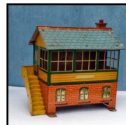
Pre-war No. 2 Signal Cabin, with hinged roof