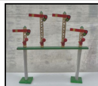
Pre-war No. 1 Signal Gantry 'Home'.