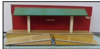
Post-war Island Platform 'Trent'. With ramps. Boxed.