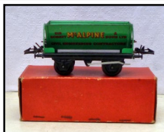
Post-war Side Tipping Wagon Sir Robt. McAlpine', boxed