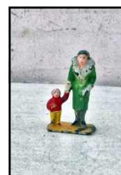
Pre-war Hornby Railway Accessory: 'Mother and Child'

For full descriptions and prices, please refer to main sales pages To order any of the above items send an e-mail to: cliff@maddocktoys.com