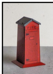
Railway Accessory: 'Platform Fire Hut'