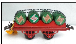
Barrel Wagon, with four 'Castrol' barrels, double-chain