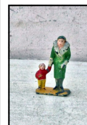
Pre-war Hornby Railway Accessory: 'Mother and Child'

For full descriptions and prices, please refer to main sales pages To order any of the above items send an e-mail to: cliff@maddocktoys.com