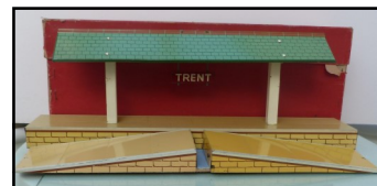
Post-war Island Platform 'Trent'. With ramps. Boxed.