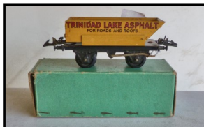
Post-war No. 50 Rotary Tipping Wagon with box