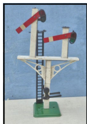
Post-war No. 2 Junction Signal 'Home' (also available as 'Distant')