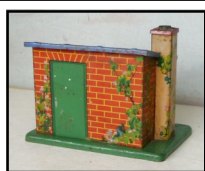
Platelayer's Hut. Non-hinged door