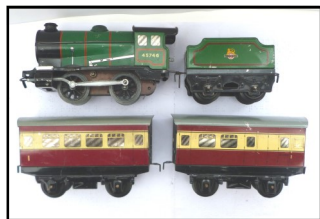
No. 30 Passenger Train Pack