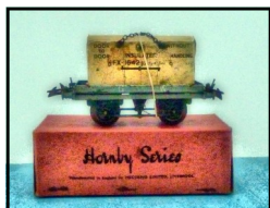
No. 1 Flat Truck G.W. , with Container. Boxed