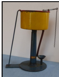
Pre-war No. 2 Water Tank, Complete with ladder and hose