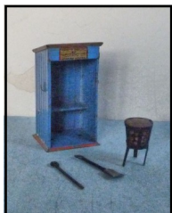
Watchman's Hut with Brazier and Tools