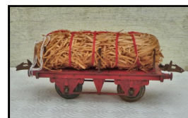
Fibre Wagon, red, with original load of imitation fibre (wood-wool)