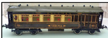
No. 2 Special Pullman Composite Coach 'Verona'