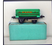
Hornby 1950s No. 50 series Side Tipping Wagon 'McAlpine'.