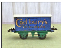
Hornby 1930s. Private-Owner Van 'Cadbury's'.