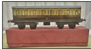
Hornby No. 2 Passenger (non -Corridor) Coach G.W.R. Boxed