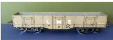
Hornby No. 2 High Capacity Wagon, grey, L.M.S.