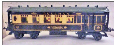
Hornby No. 2 Special Pullman Composite Coach 'Verona'