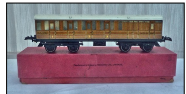
Hornby No. 2 Corridor Composite Coach Brake/3rd, L.N.E.R. teak.