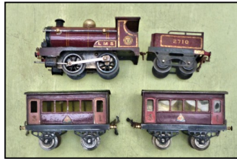
First-issue Coaches 'Midland Railway' with post-grouping Tender Locomotive L.M.S.