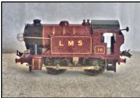
Hornby E120 Special Tank Loco. L.M.S. No. 70