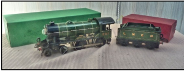
Hornby E220 Special Tender Loco. L.N.E.R green No. 201 'The Bramham Moor'