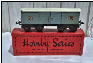
Hornby 1930s-issue No. 2 Luggage Van, grey, N.E.