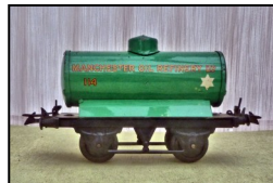
Hornby 1950s Tank Wagon, green, 'Manchester Oil Refinery'