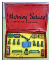
Hornby Railway Accessories. Set. 17 pieces . In original box.