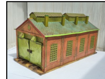
1930s No. 2 Engine Shed. Double length, double track.