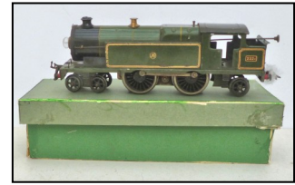
Hornby No. E220 Special Tank Locomotive G.W.R. (electric)